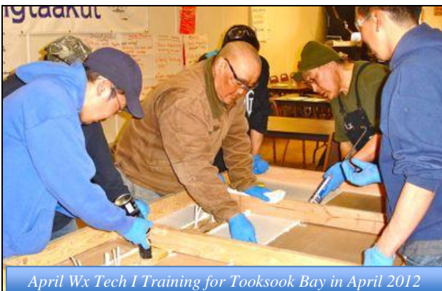
April Wx Tech I Training for Tooksook Bay in April 2012